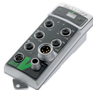
Frequency-dependent processor unit of an RFID system for operating multiple read/write heads or antennas