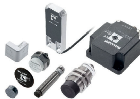
Read/write heads and data carriers in various form factors to match user requirements