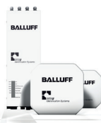
Antenna and processor unit of a UHF-RFID system for reading and writing over long ranges

There are essentially two identification technologies: RFID (Radio Frequency Identification using radio waves) and barcode readers (image recording and processing).