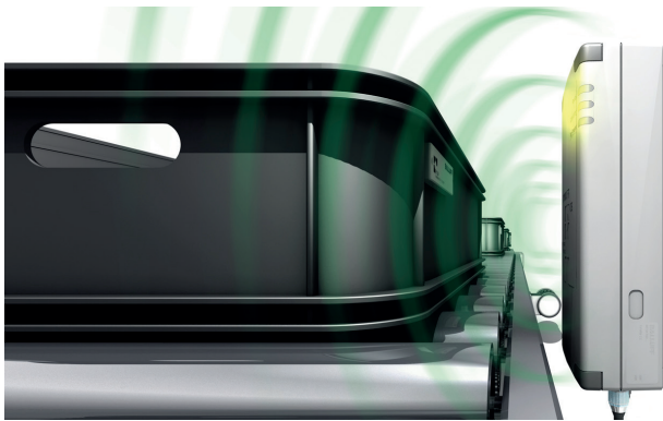
Reading and writing data carrier information on small load carriers using RFID for uninterrupted tracking

By using industrial identification systems you ensure that in an automated production process the right parts arrive at the right place at the right time and in the right quantity – for example in asset tracking, production control or intralogistics. These systems ensure quality and help you to reduce costs.