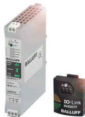
Power supply with IO-Link (IP20)