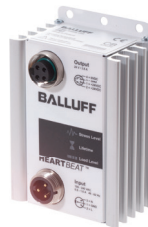
Power supply for use directly in the field (IP67), also in harsh conditions