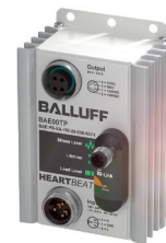
Power supply with IO-Link (IP67)

In addition to these criteria you should also take into account the ambient temperature and – if necessary – make any modifications (e.g. cooling). Only then is maximum performance of the power supply assured.