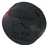
Data carriers designed for tool identification, installed directly in metal

RFID tags are also attached to injection molds and punch tools. These data carriers provide information about the setting parameters as well as data for the use, maintenance and association with the machine in which the tools are used. An RFID reader/writer can read out the data and pass it along to the machine controller. This makes condition monitoring and predictive maintenance possible.