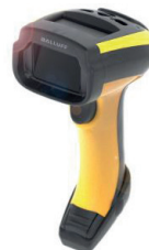
Portable handheld reader for reading 1D and 2D barcodes