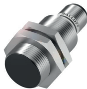
Compact read/write head for simple handling and flexible installation