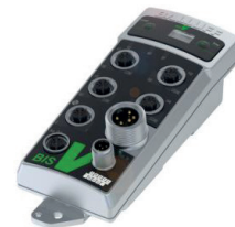
Frequency-dependent processor unit of an RFID system for operating multiple read/write heads or antennas

Managing assets such as tools, molds, etc. place application-specific demands on the characteristics of the RFID components: