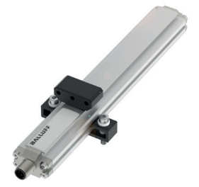
IO-Link-capable magnetostrictive linear position sensor for measuring linear positions