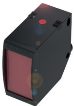
IO-Link-capable photoelectric distance sensors for measuring distances

At a winding station the roll diameter and sag need to be continuously monitored. Non-contact, photoelectric distance sensors keep you on the safe side. Another advantage: the IO-Link interface significantly increases signal quality compared to the previous product. In a hydraulic power unit, such as on a machine tool, the pressure needs to be reliably monitored. IO-Link pressure sensors provide you with more accurate measurements while the plug-and-play design and unshielded standard cable make for simple installation.