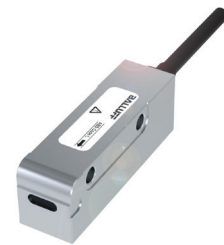
IO-Link-capable magnetic-coded position sensor for measuring linear and rotating positions

Various IO-Link capable measurement sensors are available to meet your application needs: