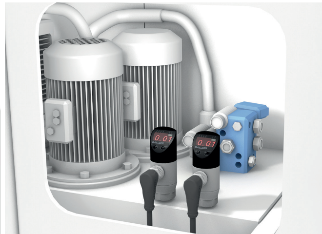
Measuring the pressures in a hydraulic power unit – for example on a machine tool – with the help of two IO-Link pressure sensors

At a winding station the roll diameter and sag need to be continuously monitored. Non-contact, photoelectric distance sensors keep you on the safe side. Another advantage: the IO-Link interface significantly increases signal quality compared to the previous product. In a hydraulic power unit, such as on a machine tool, the pressure needs to be reliably monitored. IO-Link pressure sensors provide you with more accurate measurements while the plug-and-play design and unshielded standard cable make for simple installation.