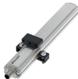
IO-Link-capable magnetostrictive linear position sensor for measuring linear positions