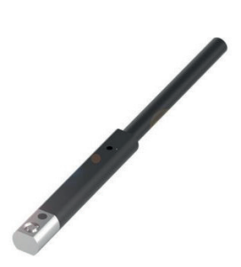
Magnetic field sensors for the C-slot for detecting the piston position on pneumatic cylinders

A magnetic field sensor integrated into the slot detects the opening condition (open/closed) of a gripper or the position of a pneumatic ejector. This allows you to ensure that blister packs are exactly positioned in boxes or that improperly packaged matches are sorted out. Magnetic field sensors feature a compact form factor and ease of installation.