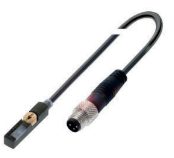
Magnetic field sensor for the T-slot for detecting the piston position on pneumatic cylinders

The magnetic field sensor detects the magnetic field strength of a permanent magnet. This also works through non-magnetic walls, such as through an aluminum cylinder. If the threshold value (magnetic field strength) is exceeded, the sensor generates a switching signal. The miniaturized electronics allows you to install these sensors directly in the C-slot (3.8 mm). Form factors for other slot types, e.g. T-slot, and for other attachment options are also available.