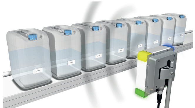
Individual identification of the individual product and simultaneous detection of multiple data carriers with UHF-RFID

The demands on data acquisition in material flow are numerous: containers must be detected on conveyor belts and products registered on pallets when they leave a plant through a door.