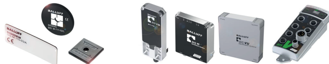
Different data carriers for various container types

This comprehensive transparency means you can optimize the process steps – including material supply from your vendors. Furthermore, consistent data acquisition also means you can take targeted corrective measures.