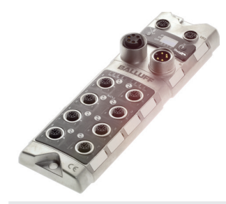
IO-Link master in metal for decentralized use

A large number of different fieldbuses have become established over time. Since IO-Link is fieldbus-neutral, the device level with IO-Link remains unchanged regardless of which fieldbus you are using.