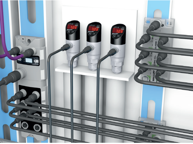
Networking PLCs and IO-Link masters (various fieldbuses) and connecting to IO-Link field devices in a machine