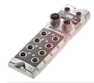
IO-Link master in metal for decentralized use

A large number of different fieldbuses have become established over time. Since IO-Link is fieldbus-neutral, the device level with IO-Link remains unchanged regardless of which fieldbus you are using.